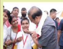
WORLD DISABILITY DAY DECEMBER 3

To hold Spoken English Central Test-II for Class X